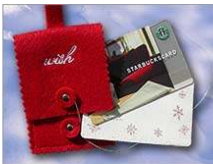
Starbucks holiday gift card for 2005